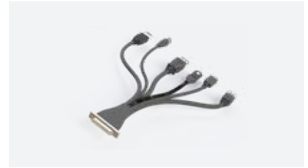
LW-Node wire ended integration connector (DC power, RJ 45 Ethernet, USB 3.1, Expansion port, Fan Header)