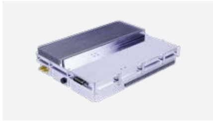
RFeye 100-18 LW sensor