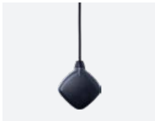
GNSS passive antenna