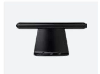
V/UHF blade antenna

(30 MHz – 512 MHz) W x H x D (276 x 70 x 128 mm) Weight (450g)