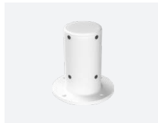
Compact wideband omni passive antenna

(500 MHz – 18 GHz) W x H x D (60x65x35.1mm) Weight (108g)