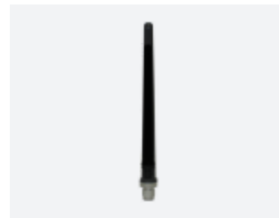
UHF stub passive antenna (315 MHz – 515 MHz)

(500 MHz – 18 GHz) W x H x D (60x65x35.1mm) Weight (108g)