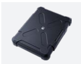
External 1TB SSD 2.5 inch data drive

(30 MHz – 512 MHz) W x H x D (276 x 70 x 128 mm) Weight (450g)